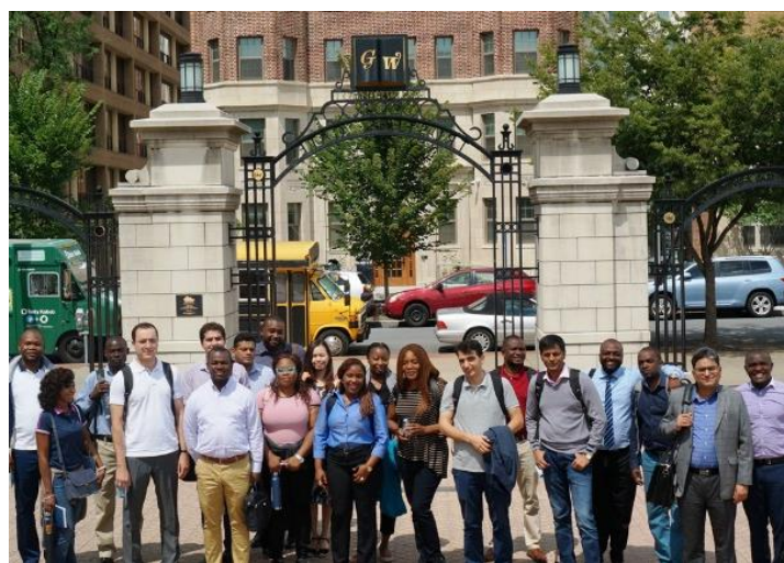
The Class of 2019 takes a first tour of the GW campus

To complement their in-class training, the Fellows are enjoying a weekly Speaker Series with practitioners as well as a set of regulatory modules hosted at the U.S. Securities & Exchange Commission – an exciting new development for this year.